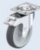
Nylon wheel centre with polyurethane tread LE-PATH 125G-FI